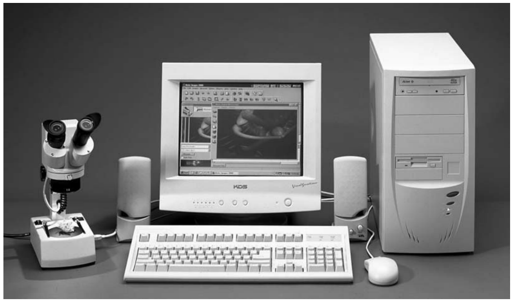
MODEL WT-02100 shown in use (computer not included)