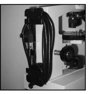
"No hassle" cord storage