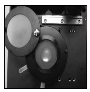
Protective iris diaphragm shield